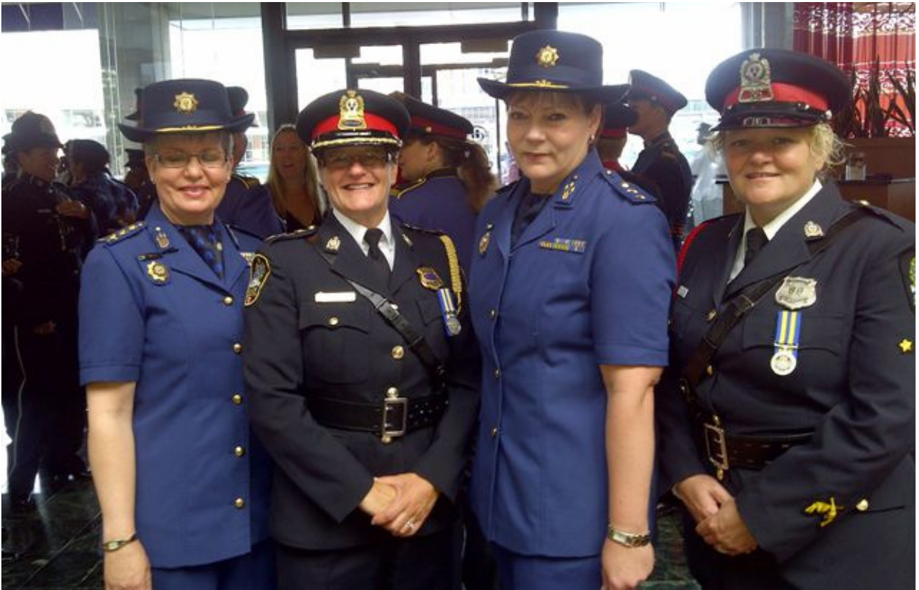
Delegates from South Africa Police 2013 conference committee met with Canadian delegates in Lexington Kentucky 2011