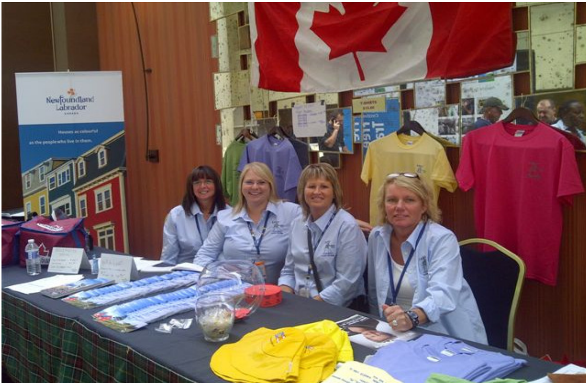
2012 Newfoundland Committee members working the conference promotion booth in Lexington 2011.