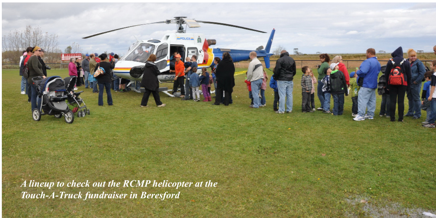
A lineup to check out the RCMP helicopter at the Touch-A-Truck fundraiser in Beresford