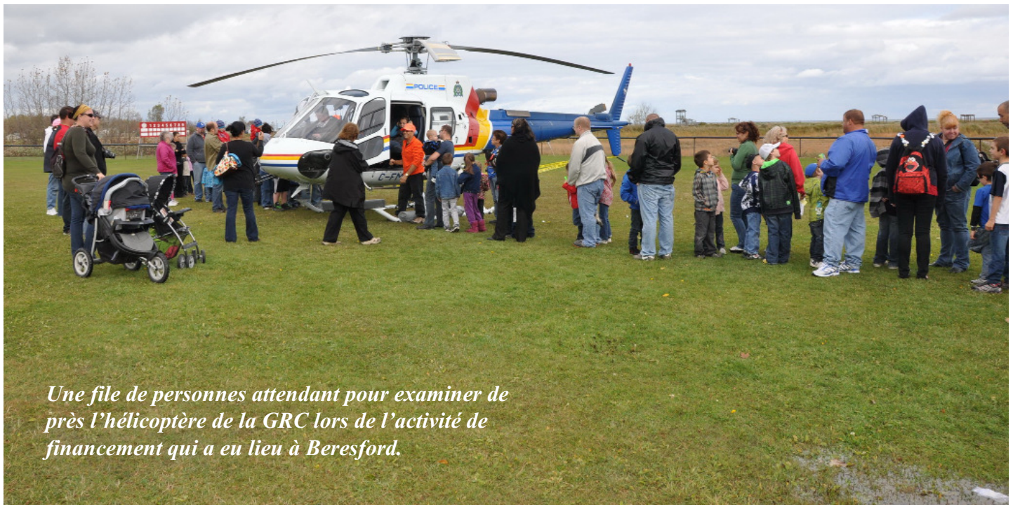
Une file de personnes attendant pour examiner de près l'hélicoptère de la GRC lors de l'activité de financement qui a eu lieu à Beresford.